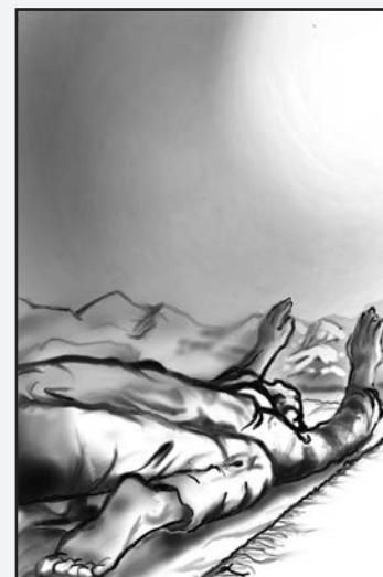
The Israelites worshiped the sun and not the One who made the sun.

Many churches today keep Sunday holy. How did Satan convince Christians to honor Sunday?