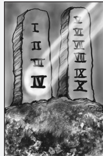
Our Sabbath keeping shows God and everyone else that we accept God’s Ten Commandments.

How does our understanding of the story in Genesis 1 and 2 change our behavior? In what way do the people, places, and ideas in your life have a part in the choices you make? How can God’s mercy help us to win the fight against our bad habits?