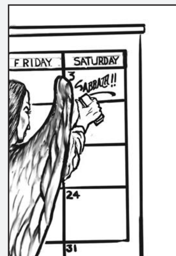
Satan's attack on the Sabbath is really an attack on God's control.

Satan's attack on the Sabbath really is an attack on God's control. Satan's sneaky plan is to trick people into accepting evolution. Then Satan will destroy their belief in the Sabbath. Sad to say, many people today, including Christians, don't accept the Sabbath.