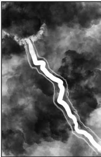
Thunder and lightning are word pictures for God's work as Judge.

God sits on a throne in heaven. Angels and other people stand around the throne. Soon, all the angels start to sing a song of praise: “They say: ‘Our Lord and God, it is right for you to have praise and honour and power [control]. You made all things. They were made and have life because you wanted them’ ” (Revelation 4:11, WE).