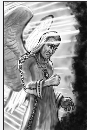
Lucifer was a beautiful angel who turned against God.

Read carefully Psalm 51:1–4. Look at verse 4. How do these verses help us understand God's work as our Judge?