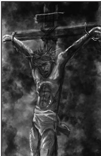
Jesus' death on the cross shows us that God's law can't be changed.

Read this powerful quote from Ellen G. White about the Good News and God's work as our Judge: "The Bible shows us that God's people stand in dirty clothes before God. He is our Judge. This word picture shows us that we must empty our hearts of all pride. All Christians should make their hearts clean. We should obey God's law. We should not have any pride in our hearts. The more we look at the perfect life of Jesus, the more we will want to be the same as He is in our hearts. We will see that all the good in our hearts comes from Jesus. We will see we are sinners. At the same time, we will depend on Jesus. Jesus makes us holy. Jesus is the only One who can answer Satan when he accuses us of sins. Jesus goes to God for us and argues our case in court. Jesus tells Satan to stop blaming us. Jesus can do this work for us because He died for us. We are saved because of Jesus' holy life, not because of our good behavior."— Testimonies for the Church , volume 5, pages 471, 472, adapted.