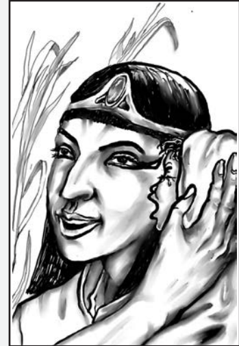
Pharaoh's daughter found baby Moses in the Nile River.

Some people may say that Moses should have stayed in Egypt. Do you agree? Explain your answer. As Christians, we have Bible promises for a better life. How can these promises help us when we suffer hard times?