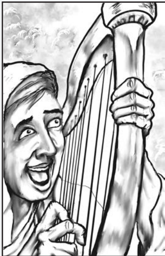
They sing praises to God with grateful hearts.

The ones who worship the Lamb “ ‘are the ones who came out of the time of much trouble. They have washed their clothes and have made them white in the blood of the Lamb’ ” (Revelation 7:14, NLV). Their lives show that God’s mercy saved them and that His love changed their lives. That’s why they sing praises to God with grateful hearts.