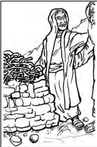
God asks Abraham to offer Isaac as a burnt offering.

Paul tells us how Abraham solves the problem about what to do. Abraham believes that God will wake up Isaac from the dead after Abraham gives him to God as a burnt offering. The faith of Abraham is surprising because we do not read about anyone in the Bible who woke up from the dead before this time. How did Abraham come to believe this powerful Bible truth? Hebrews 11:11 says that Isaac was born by the power of God. At that time, Abraham was a very old man. Sarah herself was old. She never had any children before. Paul says, “When there was no reason for hope, Abraham believed” (Romans 4:18, NIV). Abraham “believed that God could make dead people live” (Romans 4:17, WE; read also Romans 4:19, 20). Abraham and Sarah had as much chance of having a child as a dead person! But God caused Isaac to be born from their “dead” bodies anyway. So, Abraham believed God can work this same miracle in the future. God can wake up Isaac from the dead.