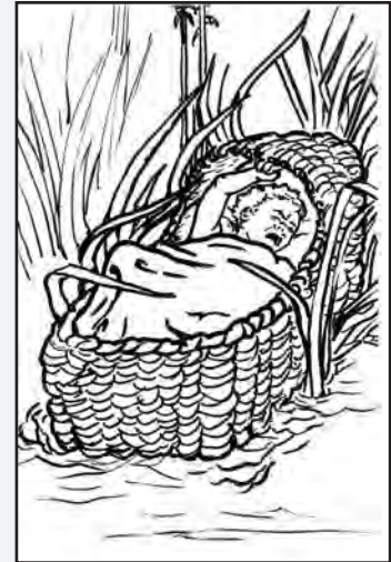
When Moses was born, his parents hid him from Pharaoh, king of Egypt.

What tests and troubles have you had because of your faith? What did you give up or lose because of your faith? How does the reward waiting for you cheer your heart?