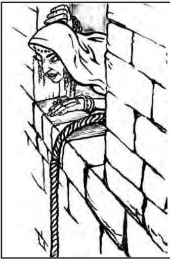
Rahab heard, believed, and obeyed without seeing the things she believed in.

So, why is Rahab on the list of heroes of faith? What was her act of faith? Rahab heard, believed, and obeyed without seeing the things she believed in. She did not see the Ten Awful Curses God put on Egypt. Rahab did not see God lead His people on dry land through the Red Sea. Rahab did not see water flow from the rock or bread fall from heaven. But Rahab believed in God anyway. She is a good example of faith for the Christians that Paul writes to in the Book of Hebrews. These Christians did not hear Jesus preach or see Him do a miracle. But they believe in Jesus and accepted Him as their Savior. Rahab is a good example for us, too. We also did not see Jesus do any of these wonderful miracles. God asks us to believe in Jesus anyway, the same as Rahab.