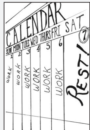
God invites humans to rest with Him.

Some Bible thinkers say God needed to rest after He made the earth in six days. But the real reason God rests is to give us an example of what we should do. Humans also must work for six days. Then we must rest on the seventh-day Sabbath. Bible expert Karl Barth says God rested on the seventh day to show humans that rest is part of His agreement with humans. The Sabbath is an invitation from God. On that day, God invites humans to rest with Him.