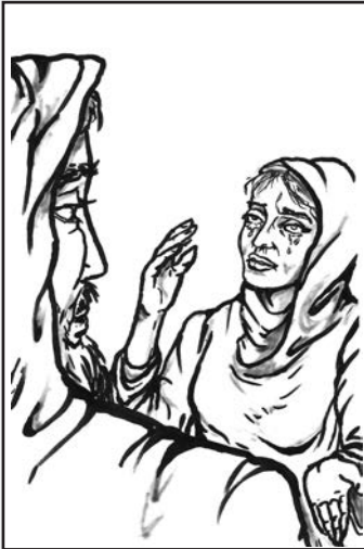
Mary Magdalene saw Jesus after He woke up from the dead.

The Bible is more special than other religious books for another reason. It is a record of human history. It does not only show us some person's thoughts. The Bible is a record of God's acts in history. The Bible shows us God's plan over time to save His people. What are some of the parts of this plan? (1) God promises to send His people a Savior. (2) God promises that this Savior, Jesus, will come a second time to take His people to heaven.