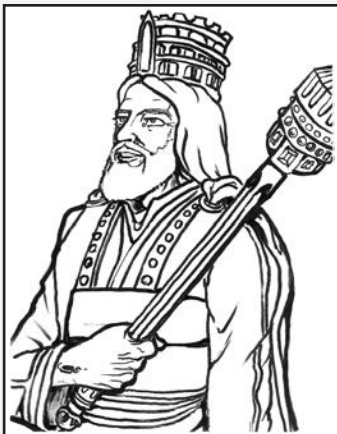
Daniel 7 shows the Son of Man getting the kingdom.

IN 548/547 B.C., God gives Daniel another dream. We can read about that dream in Daniel 8. This dream gives us more information about God’s work as Judge in Daniel 7. You will remember that the dreams in Daniel 2 and Daniel 7 start with Babylon. But the dream in Daniel 8 leaves out Babylon and starts with Media-Persia. At this time (548/547 B.C.), Babylon already was losing power. The Persians were ready to replace Babylon as the most powerful kingdom on earth. We will see that the dream in Daniel 8 gives us the same information as Daniel 7. Yes, the word pictures change in Daniel 8. That is because Daniel 8 shows us that God will clean the temple in heaven from sin. So, Daniel 8 talks about what happens in God’s temple in heaven during the end times. But Daniel 7 shows us heaven’s courtroom. It also shows the Son of Man getting the kingdom. Daniel 8 shows that God will make the temple in heaven clean. So, we see that God’s work of cleaning heaven’s temple in Daniel 8 is connected to His work as Judge in Daniel 7.