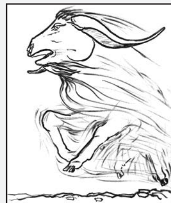
The goat moves so fast that his feet do not touch the ground.

Next, Daniel sees a goat with a big horn. This goat is the kingdom of Greece. The big horn shows us King Alexander (Daniel 8:21). Do you see that the goat moves so fast that "his feet did not touch the ground" (Daniel 8:5, ICB)? That shows us that Alexander's kingdom grew fast. That is why Daniel 7 shows us Alexander's army as a winged leopard. Daniel 8 shows us what happens next to the goat (Greece): "But after he became strong, his big horn broke off" (Daniel 8:8, ERV). Then four horns grow out of the goat's head. What do all of these horns show? The big horn shows us that Alexander will die when he is young. He dies in Babylon in June of 323 B.C. Then his kingdom is divided up. His four generals (the four horns) take control of it.