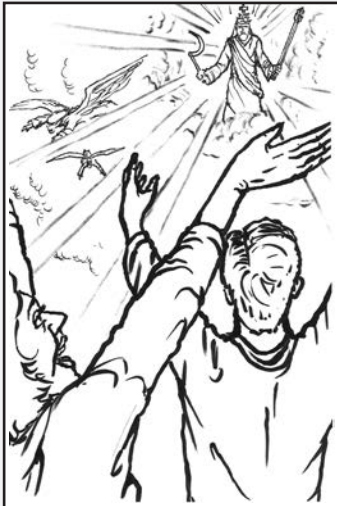
We see that God’s work as Judge in Daniel 7 leads to the end of this earth’s history.

The chart shows us that these chapters give the same information. We see the same kingdoms rise to power. Then we see God’s work as Judge in Daniel 7. His work starts after the little horn works for 1,260 years (A.D. 538–1798). The little horn’s work during this time shows us the Roman Catholic Church in the Middle Ages. God’s work as Judge in Daniel 7 happens at the same time that Jesus cleans heaven’s temple. The cleaning happens after the little horn’s power ends in Daniel 8. So, we see that God’s work as Judge in Daniel 7 leads to the end of earth’s history. God’s work as Judge is the same thing as cleaning heaven’s temple in Daniel 8. So, Daniel 7 and 8 show us the same thing in different ways. Both the cleaning of the temple and God’s work as Judge happen after the little horn makes war against God’s people for 1,260 years.