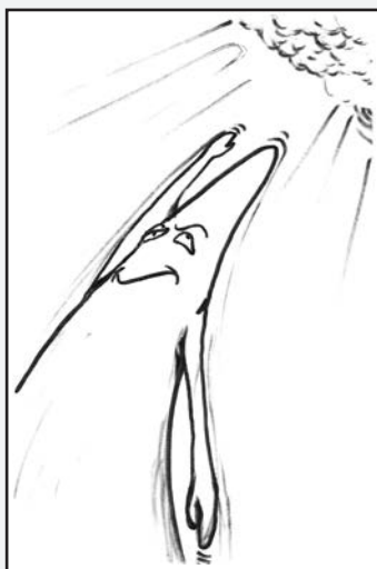
The little horn moves toward heaven.

Then the little horn moves toward heaven. In this way, the little horn behaves the same as the little horn in Daniel 7. (1) Both horns are little in the beginning (Daniel 7:8; Daniel 8:9). (2) Both horns become powerful later on (Daniel 7:20; Daniel 8:9). (3) Both horns hurt people (Daniel 7:21, 25; Daniel 8:10, 24). (4) Both horns brag and do not respect God (Daniel 7:8, 20, 25; Daniel 8:10, 11, 25). (5) Both horns hurt God's special people (Daniel 7:25; Daniel 8:24). (6) Both horns work for a certain time (Daniel 7:25; Daniel 8:13, 14). (7) Both horns continue until the end times (Daniel 7:25, 26; Daniel 8:17, 19). (8) Both horns will be destroyed by God (Daniel 7:11, 26; Daniel 8:25). As we saw, the little horn in Daniel 7 shows us the Roman Catholic Church. The little horn in Daniel 8 also shows us this same power. So, in Daniel 2, Daniel 7, and in Daniel 8, the final power on earth is Rome: first as the kingdom of Rome, then as the Roman Catholic Church.