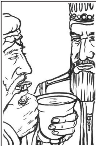
A cupbearer tastes the king's drinks before the king drinks them. A cupbearer makes sure these drinks are safe.

When Nehemiah gets bad news, he cries at first. Then he fasts and prays. What does his example show us that we must do when there is trouble in our lives?