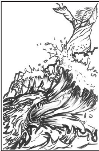
Satan, the dragon, spits a flood of waters out of his mouth to destroy the “woman,” who is God's church.

At the end of the time that the “woman” stays in the wild land, Satan starts a new attack against her. Satan, the dragon, spits a flood of waters out of his mouth to destroy the “woman,” who is God's church. The Bible often uses a flood as a word picture to show us the evil people who want to hurt God's people (Isaiah 59:19). But the earth, a word picture for America, swallows the waters and saves the woman from her attackers (Revelation 12:16).