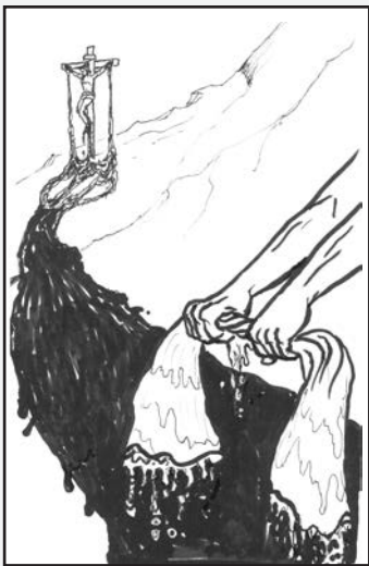
The 144,000 believers wash their robes and make them white in the blood of the Lamb (Revelation 7:14).

The words “without blame” come from the Greek word “amōmos [ä’-mō-mos]” which means “not guilty.” Amōmos shows us that the 144,000 are loyal to Jesus and obey Him. In the Old Testament, Abraham (Genesis 17:1) and Job (Job 1:1) were innocent. God made them right with Him. He made them holy. Two thousand years ago, Paul told all Christians also to be holy (Ephesians 5:27; Philippians 2:15).