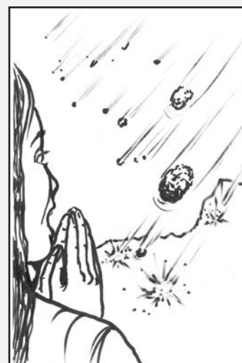
The 144,000 will experience the time of trouble (Revelation 7:15–17).