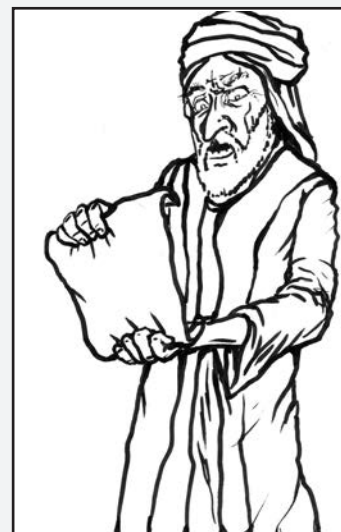
Some leaders in the Christian church read the letters that told lies about Paul and believed them.