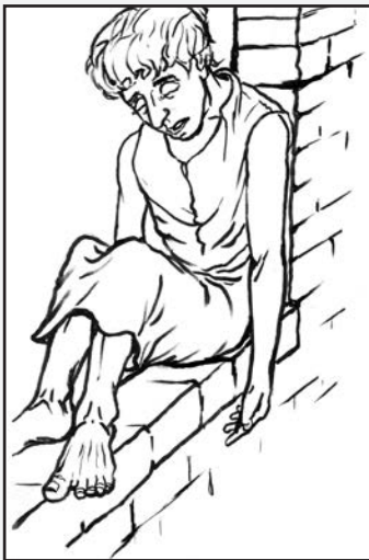
Eutychus fell into a deep sleep during Paul’s sermon. This fact tells us that Paul’s meeting happened at night.

How does the Bible teaching about the Sabbath help make our faith stronger?