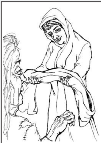
Dorcas loved and cared for believers and unbelievers alike.

Read Acts 9:36–42. What does Dorcas do in Joppa when she discovers the needs around her? In Acts 9:41, what do the words “the believers, especially the widows” (NIV) mean?