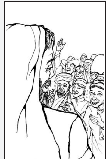
God’s plan always has been to pull all people of the earth to Him.

Read Romans 4:1–12. In what ways is the gospel, and the worldwide reach of the gospel, taught in these verses?