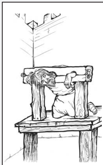
Jeremiah was beaten for preaching God's word and locked in stocks.

Read Jeremiah 20:1–6. How did the people receive Jeremiah's message?