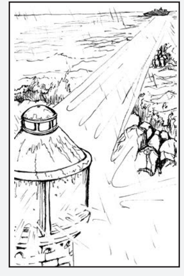
We are to be God's light to the world.

Of course, no one ever said that it was going to be easy. We are in the middle of a great controversy (war between Christ and Satan). And the enemy will work every way he can to stop our outreach work in our own neighborhoods or in the farthest corners of the world. But we must not be discouraged, because we have been given many wonderful promises of power. And we can be sure that God will fulfill His purposes on earth. As we have been told: "'The words I speak are like that. They will not return to me without producing [making] results. They will accomplish [succeed] what I want them to. They will do exactly what I sent them to do'" (Isaiah 55:11, NIrV).