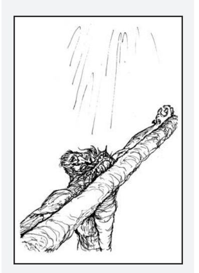
The Cross is proof of God's love for us and desire to save us.

In what ways can you personally (not the pastor, not the elder, not the deacon, but you ) better learn to "show forth His glory" to a dying world? What must you change in your life in order to do this?