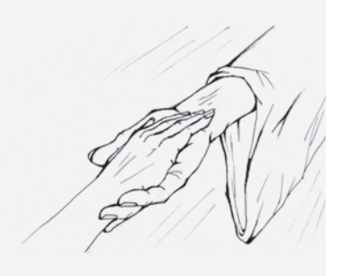
The truly wise will be humble like Jesus, willing to overlook the faults of others.