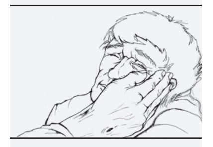
"Our great need is our only claim on God's mercy."

Look at yourself. What in you makes you worthy of salvation? How does your answer help you understand the great need of grace in your own life? How does the Cross, and the Cross alone, answer that need?