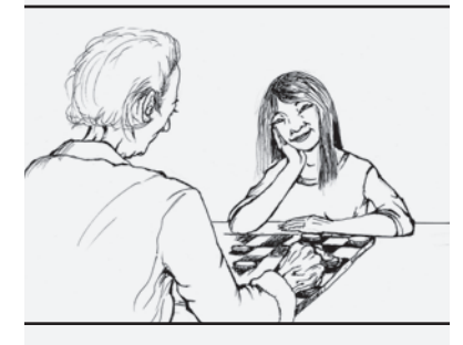
We must draw near to those who most need our help.

Jesus' life is the greatest example we will ever have of selfless love for those who did not deserve it and did not love back. How can we learn to love these types of people? Why is complete self-surrender and death to self the only answer?