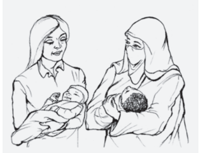
How we treat those who are different is a test of Christian love.

Let us face it: we might not be as open and as sensitive about it as James described. But do we not all play favorites? How can we learn to recognize this problem in ourselves and deal with it?