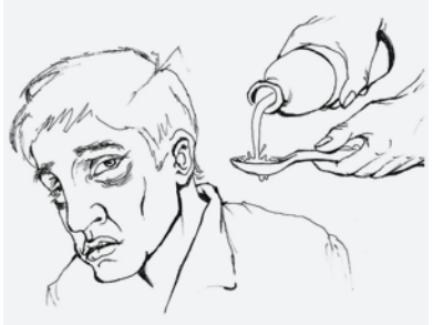
Who takes medicine without first admitting to being sick?

Bad character habits are hard to change. And even when we stop doing them, we can be overcome by them again. What should our weaknesses and our desires to give in to sin tell us about our need to surrender fully to the Holy Spirit?