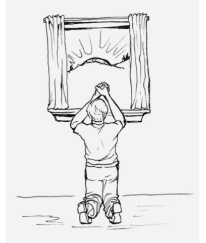
We must ask to be filled with the Holy Spirit each day.

If someone asked you if you had ever been "filled with the Spirit," how would you answer, and why?