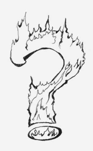
The nature of the Holy Spirit is a mystery that cannot be explained.