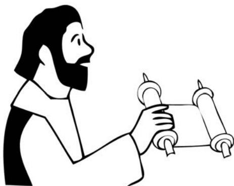
John ate the book as commanded.

and His resurrection (return to life) was a disappointment. Such was the experience of the Millerites in 1844. How can we handle disappointments without losing our faith? What Bible promises can you hold on to during your own times of disappointment?