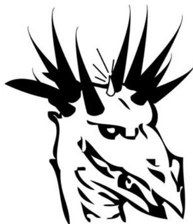
The little horn became the main enemy of God and His saints.

The judgment scene is the center of the entire vision. It shows two important figures, the Ancient of Days and the Son of Man. Angels also are there. They are witnesses to the judgment. The scene moves along in three steps: first is the court scene (verses 9, 10), then the end result of the judgment on the beastly powers on earth (verses 11, 12), and finally the transfer (change) of dominion (control) and kingdom to the Son of Man (verses 13, 14). God the Father is pictured as the Ancient of Days and the excellent, wise Ruler and Judge. “The Son of Man” (NKJV) is Jesus Himself, and He represents all people in the heavenly court. Jesus used this title many times about Himself. At least two times He clearly referred back to Daniel 7 (Matthew 24:30; Matthew 26:64).