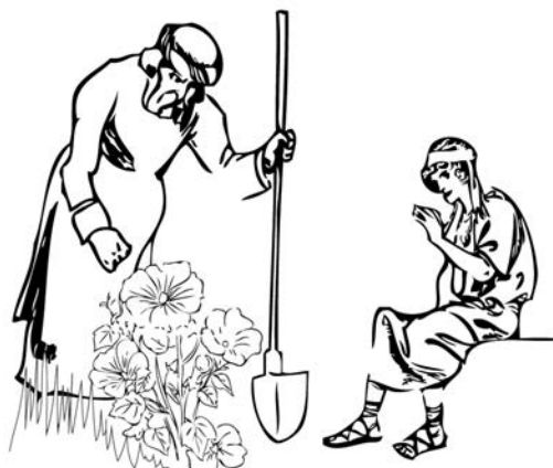
Jesus is over us like a son in control of his father's house.

Jesus is in heaven "for us." What does that mean? How can you receive hope, comfort, and safety from this wonderful truth?