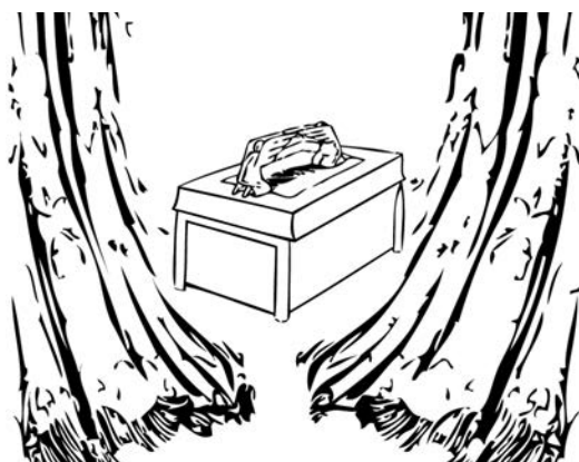
God showed that Jesus’ death was enough to deal with sin.

Look around at the world. Look at the damage that sin has caused—the pain, the loss, the fear, the hopelessness. How can we learn, day by day, moment by moment, to hold on to Jesus as the only answer to the sin problem in our own lives?