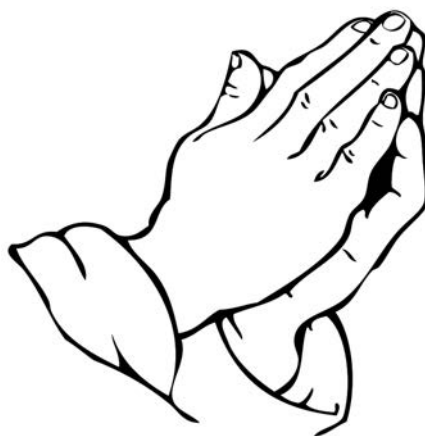
Prayer and faith will do what no power on earth can do.

"We, too, must have times set apart for meditation 8 and prayer and for receiving spiritual refreshing. We do not value the working power of prayer as we should. Prayer and faith will do what no power on earth can do."—Adapted from Ellen G. White, The Ministry [Work Done for God] of Healing , page 509.