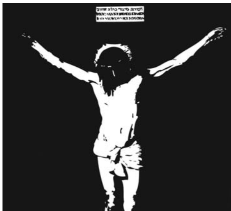
Grace is not cheap, even if it's free.

People often use the wording “cheap grace.” But there is no such thing. Grace is not cheap. It is free (at least for us). But we ruin it when we think that we can add to it by our works. We also ruin it when we think we can use it as an excuse to sin. In your own experience, which one of these two ways are you more guilty of? How can you stop?