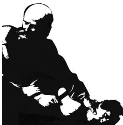
Abraham was willing to sacrifice his son Isaac at God’s command.

But Paul turns the tables on them by using Abraham nine times in Galatians as an example of faith instead of law keeping.