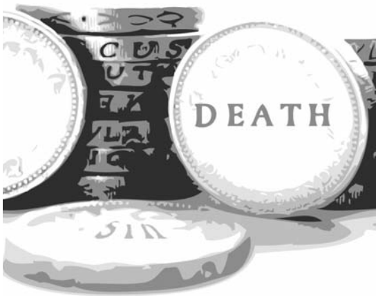
The wages of sin are death.

No wonder, then, that the cross was a stumbling block for some Jews who could not understand the idea that the Messiah was under the curse of God. But this was exactly God's plan. Yes, the Messiah carried a curse. But it was not His own. It was ours!