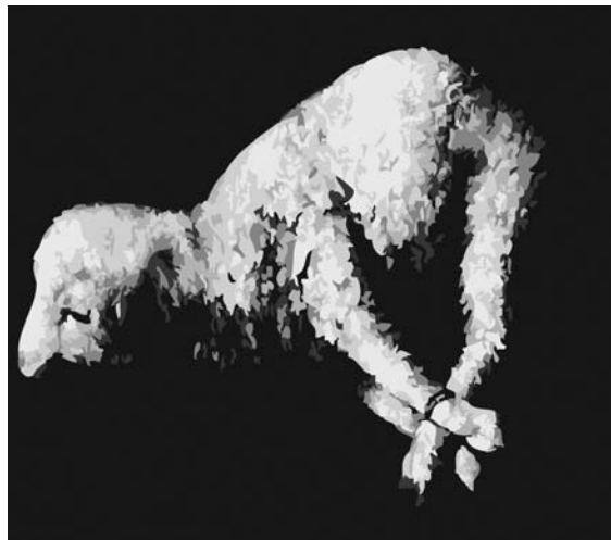
Abel’s offering showed that only the death of Christ could make a sinner right with God.

So, we are given a powerful lesson about worship: all true worship must center on the fact that we are helpless to save ourselves. We also need to know that all our hard work or efforts to save ourselves are the same as Cain’s action here. To offer true worship, we need to know that only through God’s grace 2 can we have any hope of eternal life.