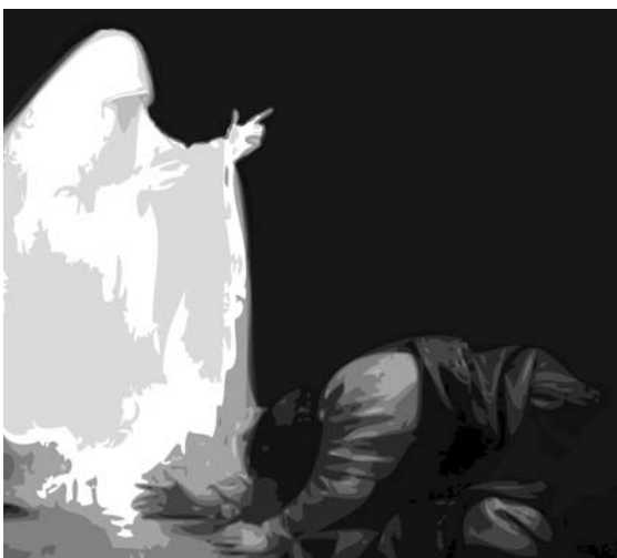
Saul bowed down before the evil spirit that pretended to be Samuel.

By letting jealousy take root, Saul followed a path to complete apostasy (backsliding) and ruin. Worse, the sins of Saul brought suffering on his own family. Sin is bad enough when it hurts us. But damage and pain often spread to other people. In most cases, our wrong actions influence others negatively too.