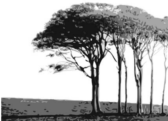
After they sinned, Adam and Eve hid from God among the trees of the Garden.

Guilt was the first negative emotion felt by humans (people). Right after Adam and Eve sinned, they started to act differently. They “hid from the Lord God among the trees of the garden” (verse 8, NIV). This action showed that they were afraid of their Father and Friend (God). At the same time, they were ashamed to face Him. Before their fall, they found joy being with God. But now they hid from Him. A beautiful bond was broken. In addition to fear and shame, Adam and Eve felt sorrow because they now knew the terrible results of disobeying God.