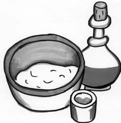
Only a handful of flour and a little oil stand between this poor woman and starvation.

Widows were not very important characters 4 in the Bible, even during the best of times. If they did not have any grown children, especially sons, to take care of them, they were not protected by laws. A widow in the time of a great drought was even worse off. Each family was fighting to live. So, there would be no charity to help poor widows. And now Elijah asks this woman, a widow, to feed him. Of all the people he could ask for help, she does not seem to be the best choice. Only a handful of flour and a little oil stands between this poor woman and starving to death.