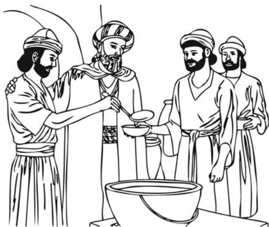
Gaius's example of kindness to the missionaries is an example to us.

What we see here deals not just with hospitality or with giving someone a place to sleep for the night. But it involves the whole principle of support for the work of ministry and missions. John is thankful that Gaius had