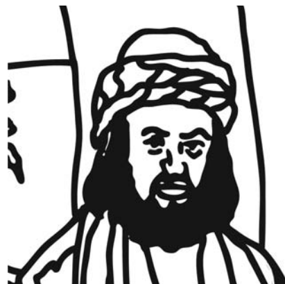
Evil has a leader in Gaius's church, and that is Diotrophes.

Verse 11 builds a bridge between what John has said about Diotrophes and what he is going to say about Demetrius. Evil has a leader, and it is Diotrophes. Diotrophes clearly is named as belonging to that which is evil. On the other hand, Demetrius is a good example for Gaius to follow.