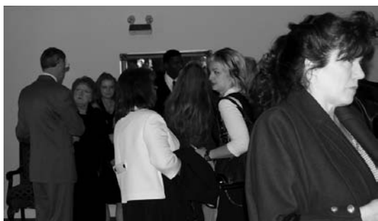
We who love God should also love our brothers and sisters.

When John talks of the commandment (instead of commandments), he means the command for us to believe in Jesus as the Messiah (Chosen One) and to love one another. In chapter 4 the commandment is that we who love God should also love our brothers and sisters.