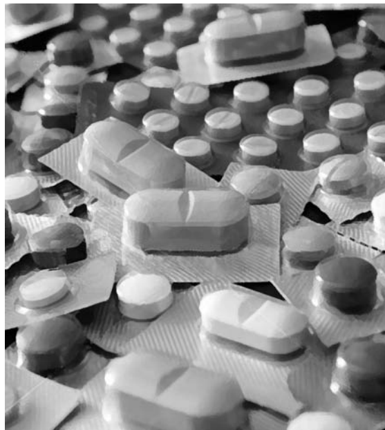
Sin kills, and no modern medicine can cure it.

Christians are always in danger of being shipwrecked by legalism 3 or cheap grace. There are those who fear that a wrong understanding of our salvation 4 in Christ will lead to cheap grace. So they point to the importance of obeying the law. On the other hand, there are those who fear that a wrong understanding