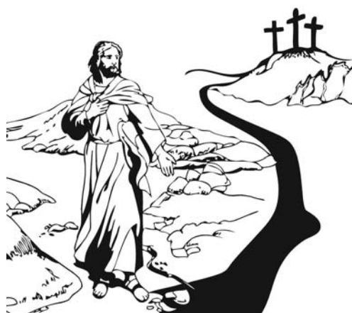
Jesus walked a path of suffering to save us.

There was a dark path (death) that Jesus “needed to” take. He needed to go to Jerusalem. He could have chosen not to go. But Jesus knew that this was a very important part of God’s plan. So, He said to His disciples “that he must [it was necessary for him to] go to Jerusalem and suffer many things . . . , and that he must [it was necessary for him to] be killed” (Matthew 16:21, NIV). He was going there because it was necessary for Him to be rejected (not accepted) by the evil generation 19 (Luke 17:25). He was to be counted with the transgressors (lawbreakers; sinners) (Luke 22:37). And He was to be lifted up (put to death; crucified) on the cross (John 3:14; John 12:34). But dying was not enough to fulfill Jesus’ mission. It was necessary for Him to be raised back to life (Acts 17:3), to be received in glory, and to remain there until all the prophecies 20 were fulfilled (Acts 3:21). He was following God’s eternal plan.