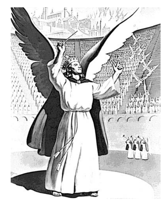
Sin mysteriously began in Lucifer, who was created good.

Notice, too, that sin began in a cherub, one of the highest-ranking classes of all the angels. Many of the cherubim were closer to God than any other class of angels. Two were placed as guardians by the gate of Eden (Genesis 3:24). Two cherubim, made of gold, were placed on the ark of the covenant4 (Exodus 25:18-20). The position of the cherubim on the ark shows the high position of this cherub named Lucifer. He stood in the light of God's presence in God's throne room (Ellen G. White, The Desire of Ages, page 758). Sin started in a cherub who was very close to the throne of God. The wording "holy mountain of God" (Ezekiel 28:14, NKJV) shows the heavenly temple, where God lives among His angels. This is the center of His government.