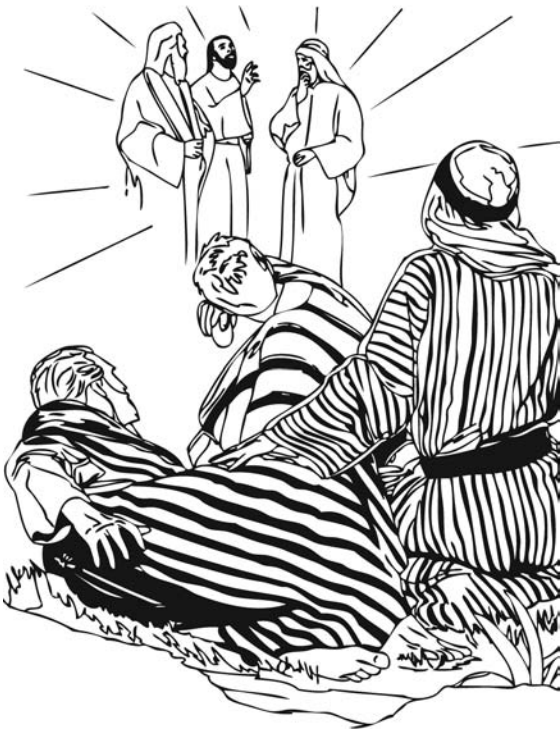
Peter watched Jesus talking with Moses and Elijah.

speak, watched the way He worked with people, and saw Him heal the sick. Peter witnessed special events such as the mount of transfiguration. 5 Peter watched Jesus talking with Moses and Elijah. He saw Jesus raising the dead. He was with Jesus when Jesus was arrested. Peter saw Jesus after He rose from the grave.