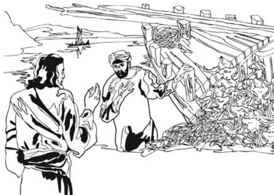
Peter left his home and work behind to follow Jesus.

Romans 11:1; Philippians 3:5; read also Acts 5:34). What point can we learn from this difference?