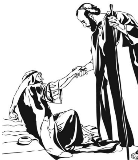
Peter heals the crippled man.

This is a wonderful miracle. But Peter is arrested and asked to answer for these unusual actions. " 'By what power did you do this? . . . And through whose name?' " (Acts 4:7, NIV). With such an invitation, Peter focuses on his favorite theme, the resurrection of Jesus: " 'You nailed Jesus Christ of Nazareth to the cross.