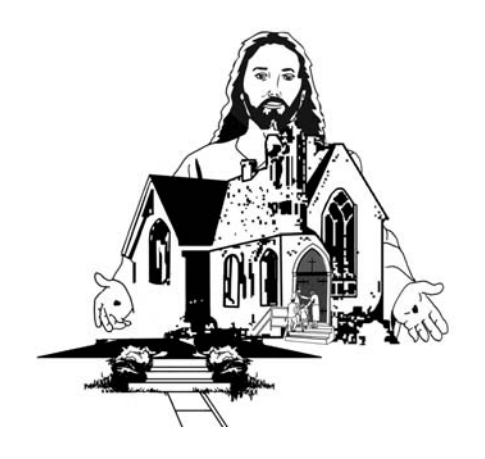
Paul describes the church as a body. Jesus is the Head, and His people make up the rest (Ephesians 4:11–16).

It is possible to be a Christian all alone. Many people who have suffered for Christ have stood alone. This is a powerful witness<sup>12</sup> to the power of God that men and women do not weaken under the pressures around them. But Paul wants to point out a very important truth: The fullness of Christ is fully shown when we are working together in fellowship with one another.