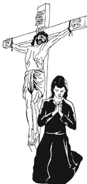
The sinner can find forgiveness for any sin at the foot of the Cross.

We might fall, we might sin, we might make mistakes. But God will not leave us. This is because of what Jesus has done and is doing for us. The plan of salvation 33 offers forgiveness to all who believe. No sin is too great, no sinner too bad, that forgiveness cannot be found at the foot of the Cross. This was the message that God gave to Israel in Jeremiah's time. And for us, it also is the message of light shining from the cross of Calvary. This is the message that the Lord has for His people today. Even if we have "played the harlot," 34 our loving and caring Husband (the Lord) loves us and wants to take us back. But He does not force us. Instead, He pulls us to Him with "bands of love" (Hosea 11:4).