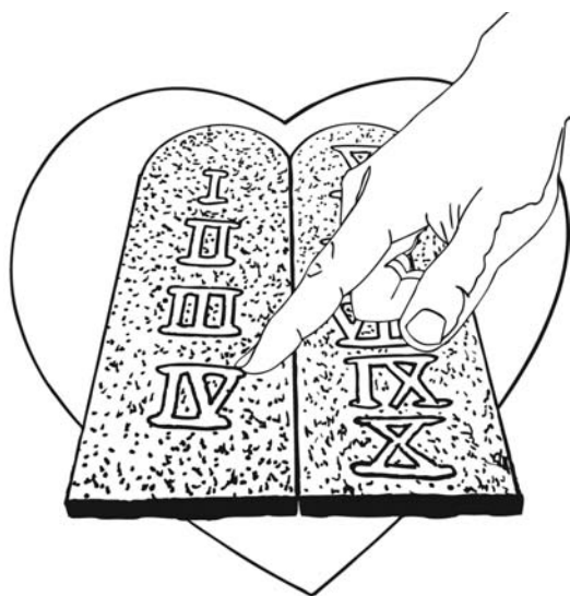
God promised to write the law in our hearts.

We might fall, we might sin, we might make mistakes. But God will not leave us. This is because of what Jesus has done and is doing for us. The plan of salvation 33 offers forgiveness to all who believe. No sin is too great, no sinner too bad, that forgiveness cannot be found at the foot of the Cross. This was the message that God gave to Israel in Jeremiah's time. And for us, it also is the message of light shining from the cross of Calvary. This is the message that the Lord has for His people today. Even if we have "played the harlot," 34 our loving and caring Husband (the Lord) loves us and wants to take us back. But He does not force us. Instead, He pulls us to Him with "bands of love" (Hosea 11:4).