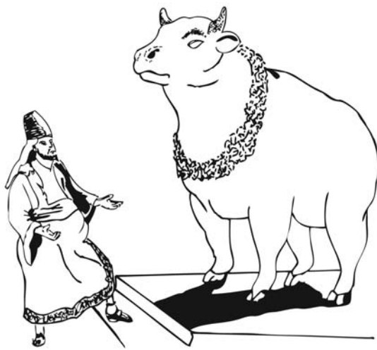
Jeroboam made golden calves for his people to worship instead of God.

During the time that David and Solomon ruled, most of the people were loyal to Yahweh (God). Jeroboam did not want his people to travel south to the temple in the land of Judah, where they might be tempted to stay and live. So, he decided to have golden calves set up for worship at Dan and Bethel (1 Kings 12:28–30). Since Jeroboam chose his own priests, the Levites from all over the kingdom of Israel moved to Judah (2 Chronicles 11:13–16). Any king who later led Israel to follow other gods was said to be following in the footsteps or ways of Jeroboam (1 Kings 16:7, 26).