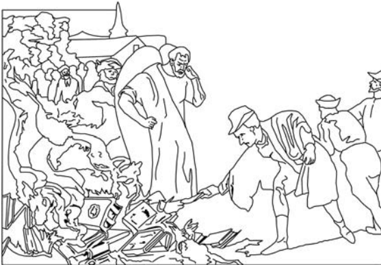
Satan has tried to destroy the Bible.

How do the words of Jesus in Matthew 24:35 foretell that the Bible would be around even in the last days?