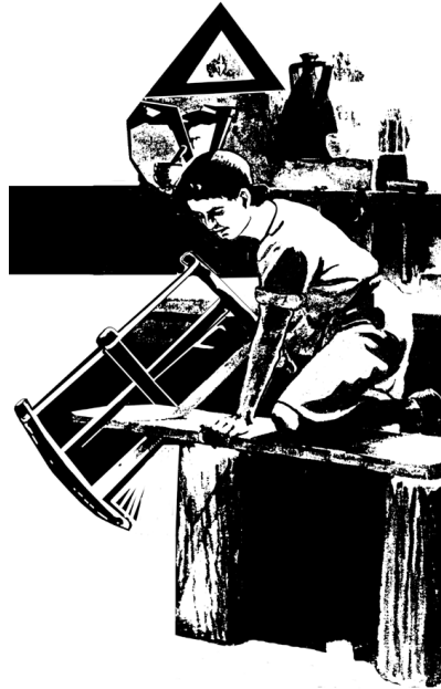
Jesus was not wealthy. When He lived at home, He worked hard for a living.