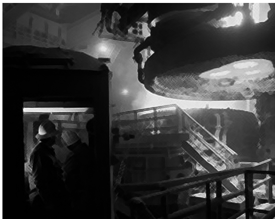
A refiner's fire makes metal pure. The Holy Spirit makes us pure by removing sin from our lives.

Fire and water are two great natural cleansing agents. So, both are used to represent the cleansing of the heart. This cleansing is the Holy Spirit's work. But fire acts very differently upon us than does water. When we think of water, we often think of something cool, refreshing, and delightful. But fire brings great heat. Fire also suggests a time of trouble, pain, and suffering (1 Peter 4:12). The idea of a refiner's fire does not make a person feel comfortable. This is because the