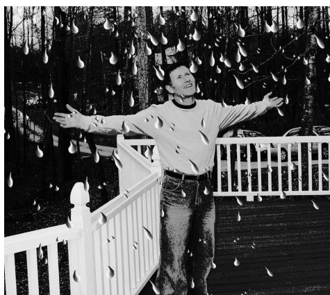
The Holy Spirit cleanses us from sin, the same as water cleanses us from dirt.

If you are a "letter of Christ," what is your message to all who "read" you?