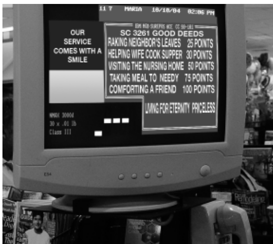
We cannot earn salvation.

gift. Justification (righteousness) by faith is without argument."—Adapted from Ellen G. White, Faith and Works , pp. 19, 20.