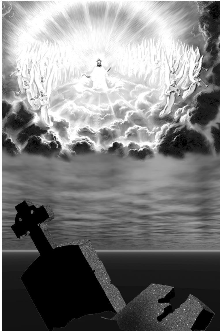
Our blessed hope!

Jesus as Lord and living under Him as Lord.