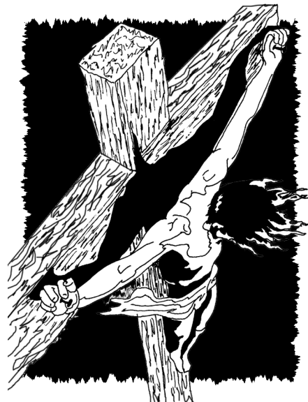
Jesus is our Creator. He is also our Savior.

The Bible is clear that Jesus is both our Creator and our Savior. Many verses talk about Jesus as our Savior. He has done the work of salvation for our sake. It is impossible to understand His death on the cross separate from salvation.