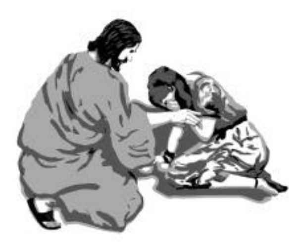
" 'Leave your life of sin' " (John 8:11, NIrV).

How do the following verses help us to answer these questions? John 8:11, 34; Galatians 2:17; Romans 6:13; 1 John 2:1; 1 John 3:8; Hebrews 3:13; Hebrews 12:4.