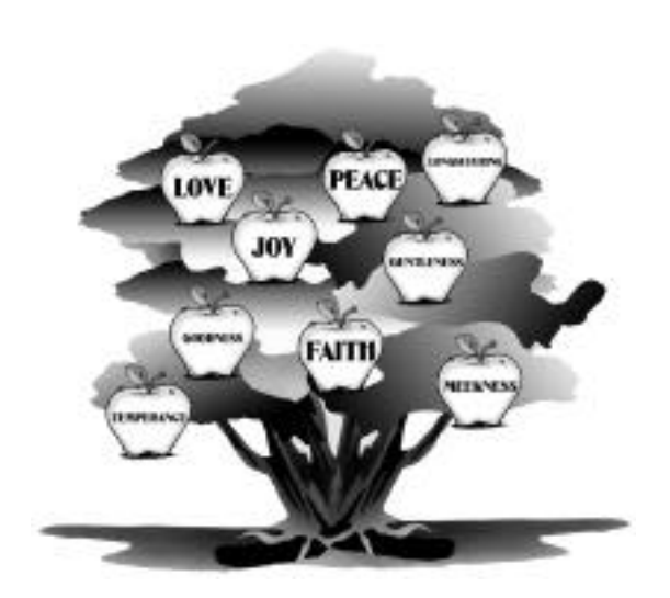
Developing the fruits of the Holy Spirit is the work of sanctification.

Imagine two people. The first person believes she has to work as hard as she can to earn the righteousness she needs to be saved. This is because she is not quite sure she has been saved. The second person works hard because she knows that she is already saved in Jesus. She knows His righteousness is her righteousness. So out of love and thankfulness she works as hard as she can for a life of obedience. Which person has a better chance of succeeding in the Christian life? Why?