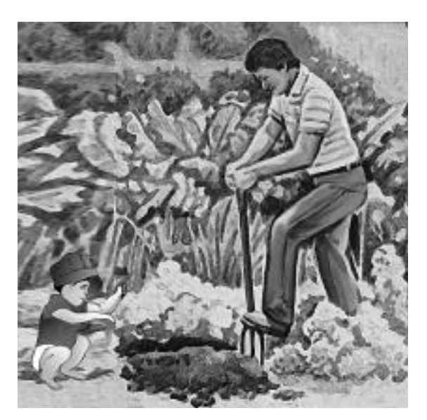
Think about things in heaven.