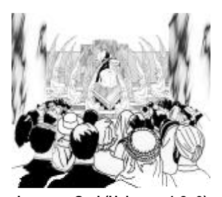
Jesus as God (Hebrews 1:8, 9).

The Bible is very clear about Jesus being human.