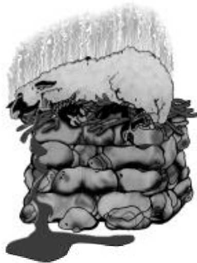
The lamb's blood symbolized Jesus' blood spilled for us on the cross.

should be destroyed. This is because sin leads to death. But God has offered a way of escape. Jesus Himself would lose His life. He would spill His blood so we could be forgiven (Galatians 1:4; 1 Peter 1:19). Blood means life. So spilled blood means death. The death of each sacrifice in the sanctuary pointed to Jesus' death. Jesus' death is the only way sinful people can be brought back to God.