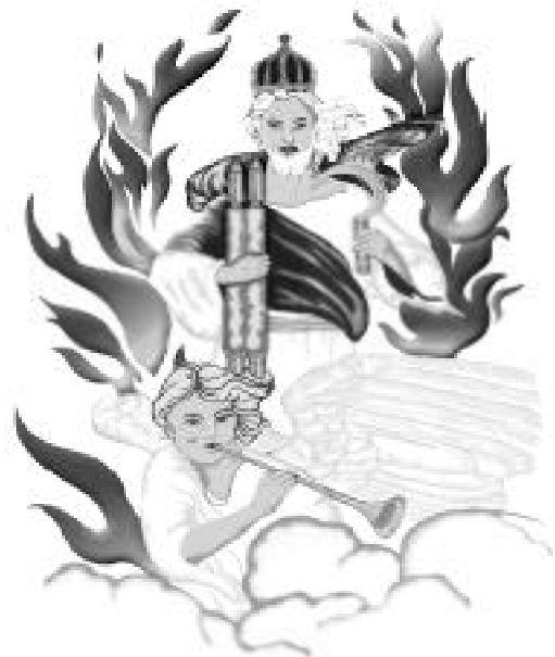
Jesus is the Son of Man.

Daniel was watching the heavenly court scene. He saw “ ‘One like the Son of Man, coming with the clouds of heaven’ ” to the Ancient of Days (God) (Daniel 7:13, NKJV). The wording “ ‘like the Son of Man’ ” means that this figure was in human form.