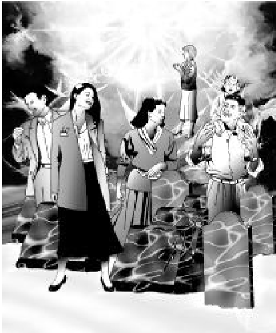
The resurrection of life—the result of a judgment already passed (John 5:29).

in the clouds. This is because they are already judged to be saints, and worthy to receive their rewards.”—Adapted from The Apocalypse, 6 Lectures on the Book of Revelation (reprint; Grand Rapids, Mich.: Zondervan Publication House, 1973), p. 181.