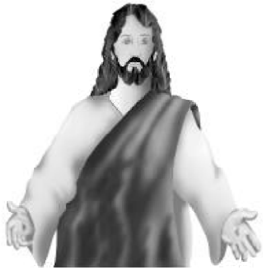
The nail scars in Jesus’ hands symbolize the names of His people.