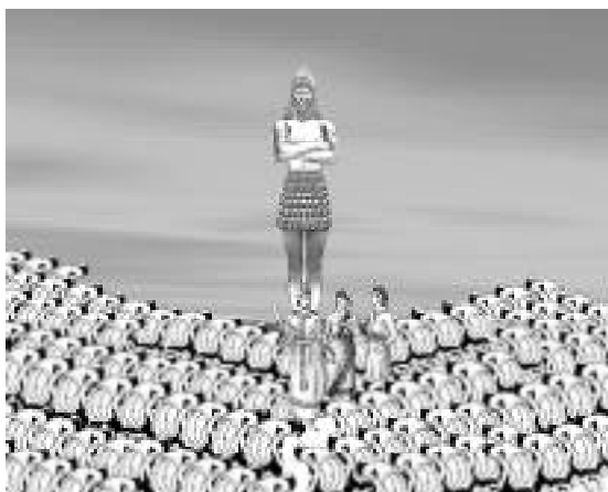
Their consciences said, No further!

Throughout Christian history there have been faithful people who have taken a brave stand. Fox’s Book of Martyrs shows the lives of thousands of Christians who were killed for their loyalty to God.