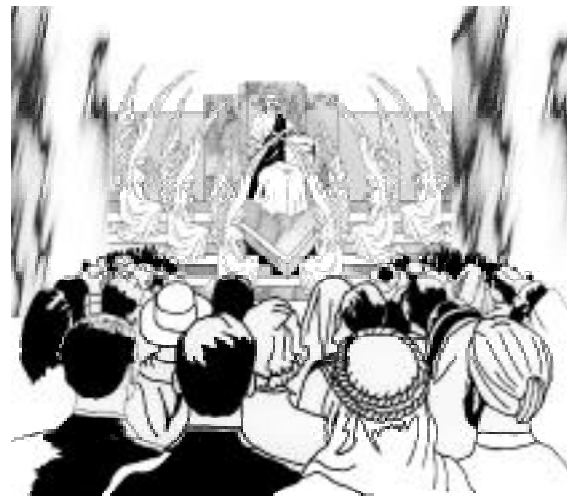
Jesus is the lamp of the New Jerusalem.

Isaiah thought the vision meant the Jerusalem he knew. But the book of Revelation explains that this vision will be fulfilled in the New Jerusalem (Revelation 21:2): “The city has no need of the sun or the moon to shine on it, because the glory of God shines on it, and the Lamb [Jesus] is its lamp” (Revelation 21:23, TEV).