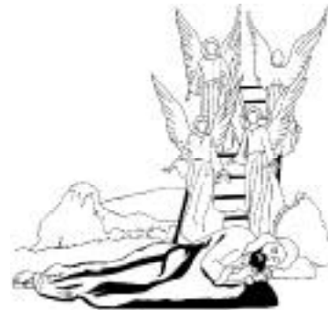
Jacob's ladder is a symbol of the true gate to heaven and God's true salvation.

A Canadian song writer, Leonard Cohen, spent a few years in a Zen 12 temple. He told an interviewer, "I am not saved." Based on today's lesson, what do you think Cohen's problem was? What did he need to know about salvation?